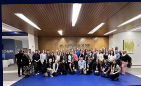
APQI Meeting with other Accreditation Professionals in Atlanta, GA.